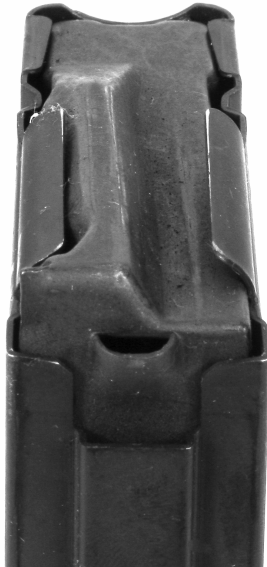
Gen II magazine with integral formed bolt catch trip