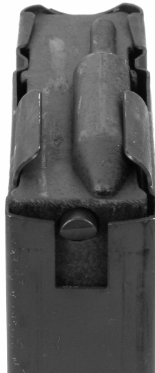
Gen I magazine with spring-loaded bolt catch trip

ArmaLite's® new Generation II 5, 10, 15, 20, and 25 round magazines differ significantly from the previous conversions. In the Generation II magazines, the bolt stop trip is formed outward from the steel follower of the magazine; therefore no internal spring is needed, and no spring resistance is created. The integral formed trip requires a wholly new magazine body that incorporates a channel at the rear to allow space for the trip.