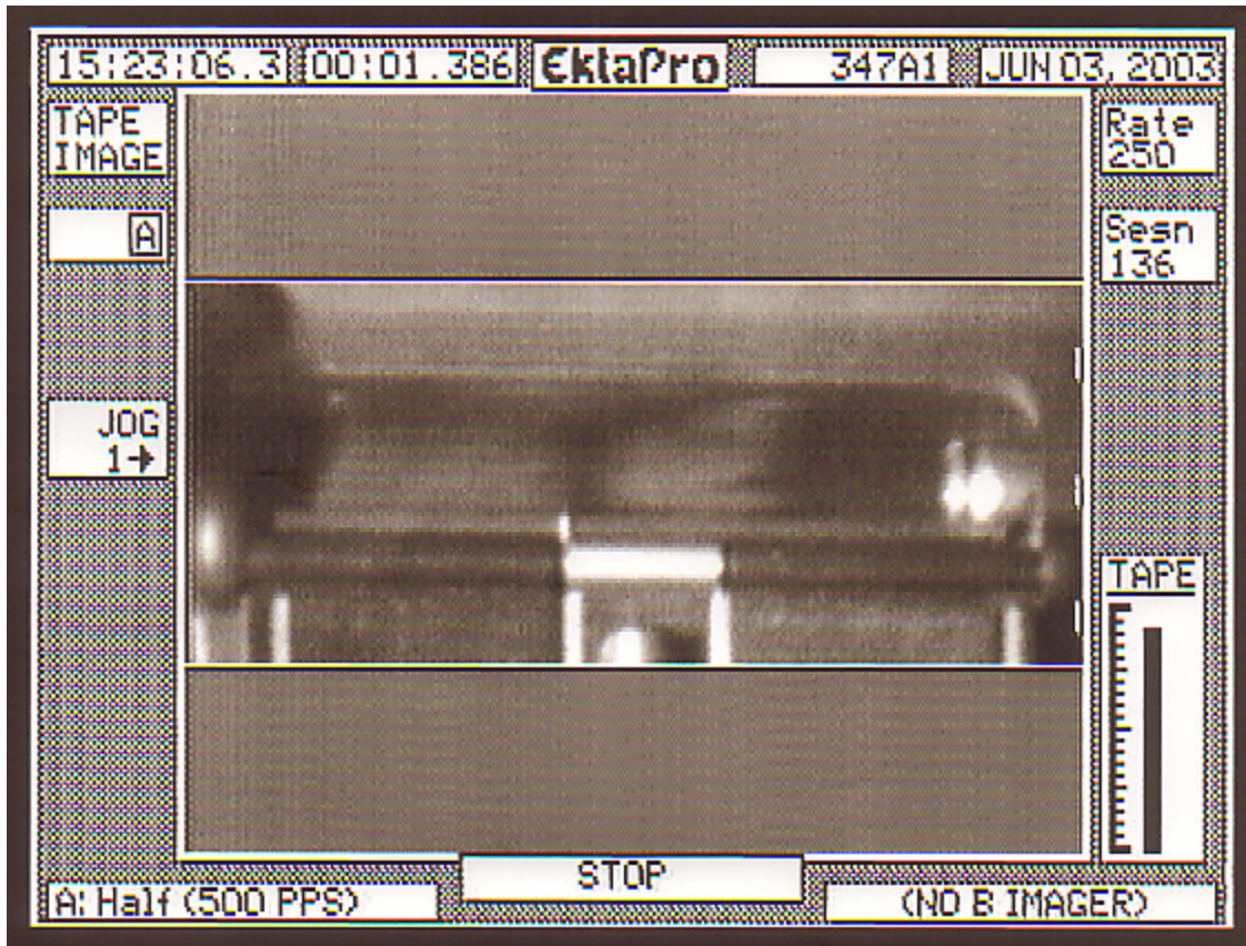
Figure 2. Bolt is moving to the rear followed by the fired cartridge. The fired cartridge is moving slower than the bolt, and cannot be ejected. Even at 500 frames per second, the bolt movement is blurred by its speed.

FINDINGS: Extensive testing was required to determine that the bolt loses control of the cartridge case very soon after pulling on it strongly enough to mark the rim, but well before the ejector can function. In other words, extraction starts, but doesn’t finish.