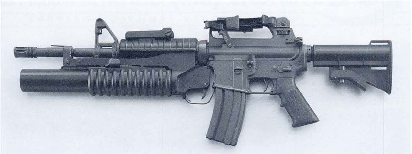
Left view M16A2 (M4) Carbine/M203 Grenade Launcher