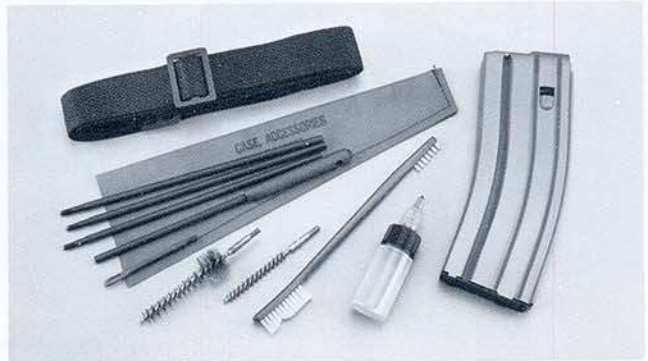
Accessory Items — Each M16A2 (M4) Carbine is shipped complete with one 30 round 5.56mm magazine, a cleaning kit and a sling.