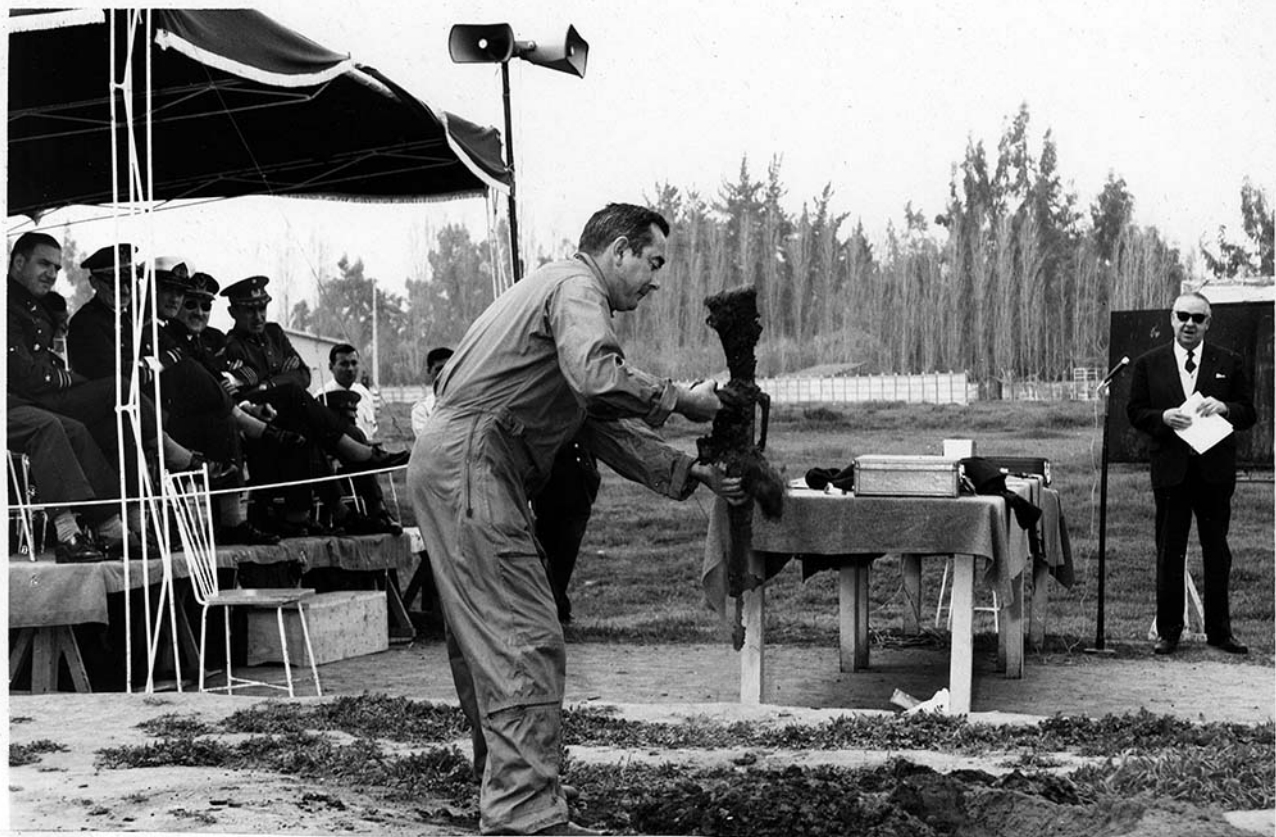
M16 BEING REMOVED FROM MUD. THE RIFLE WAS THEN FIRED WITHOUT MALFUNCTION