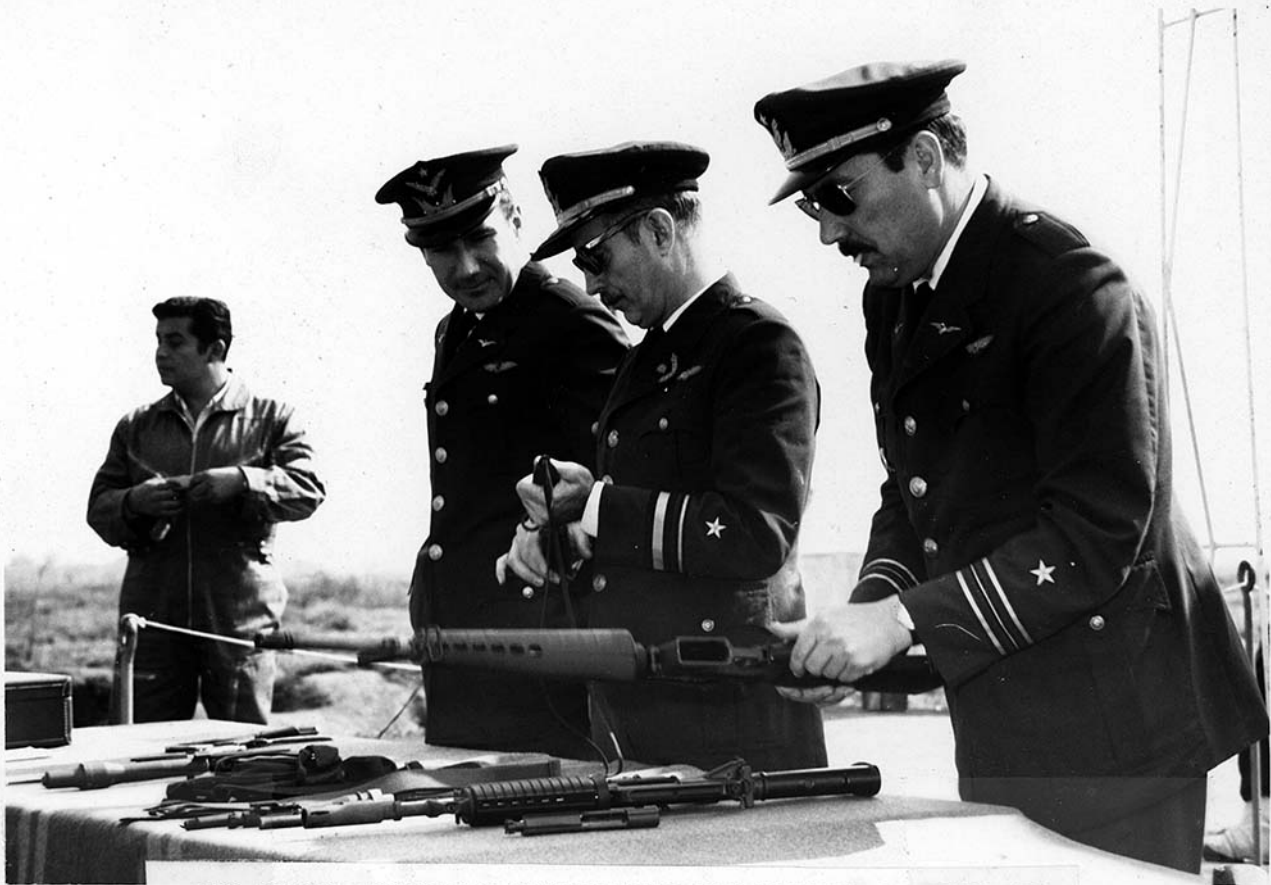
AIR FORCE OFFICERS INSPECTING M16 RIFLES ON DISPLAY