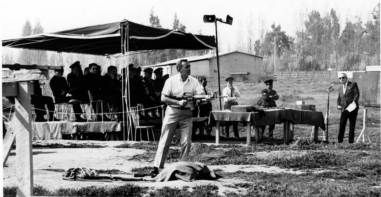
FIRING AN AUTOMATIC BURST FROM THE HIP POSITION