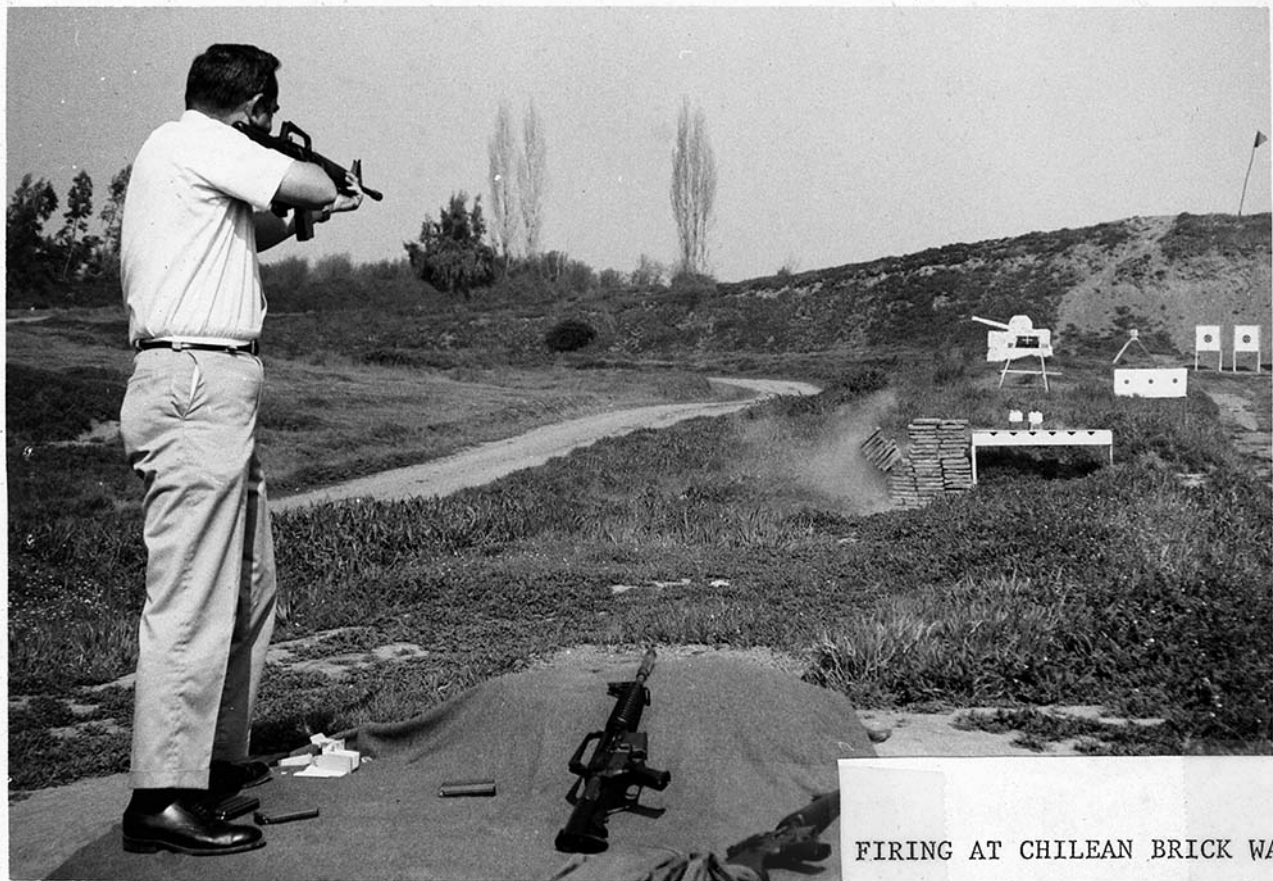
FIRING AT CHILEAN BRICK WALL