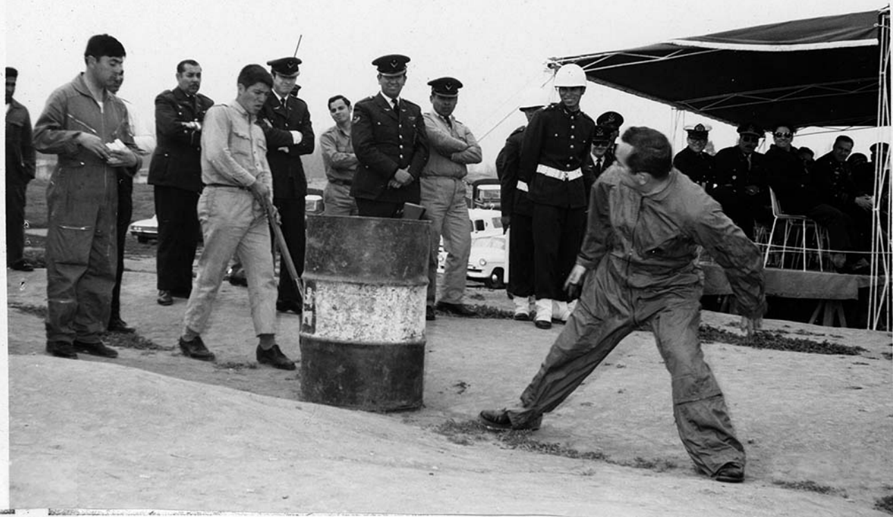
RIFLE WAS PLUNGED INTO BARREL OF WATER AFTER APPROXIMATELY 200 ROUNDS OF AUTOMATIC