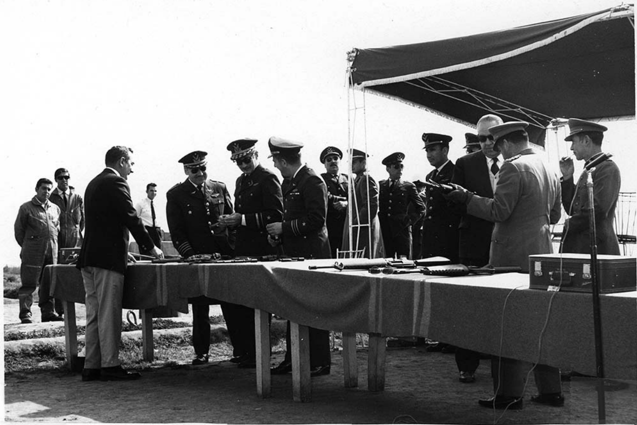
AIR FORCE, ARMY, NAVY, AND MARINE OFFICERS ATTENDED THE DEMONSTRATION