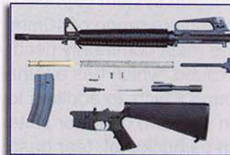
Field strips easily without special tools