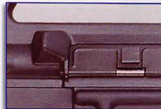
Cartridge case deflector for left handed shooting