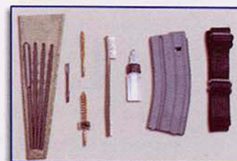
30 round magazine, cleaning kit and sling are included

- Unique direct gas operating system eliminates the conventional operating rod and results to fewer and lighter components.