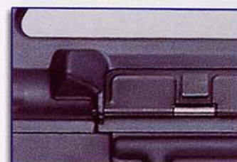
Cartridge case deflector for left handed shooting