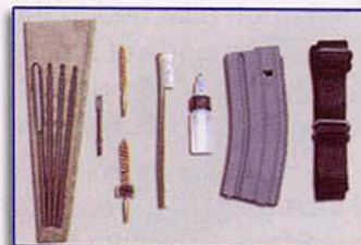
30 round magazine, cleaning kit and sling are included

- Unique direct gas operating system eliminates the conventional operating rod and results to fewer and lighter components.