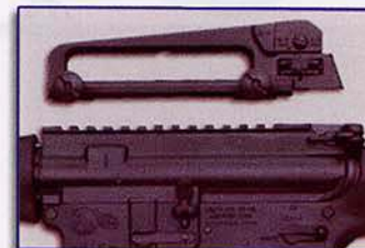
Flat top receiver allows for removable carrying handle with built in target-style rear sights, and easy mounting of accessories