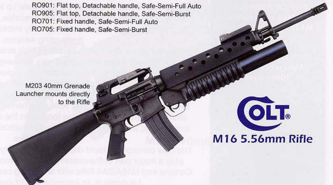
M203 40mm Grenade Launcher mounts directly to the Rifle

RO901: Flat top, Detachable handle, Safe-Semi-Full Auto RO905: Flat top, Detachable handle, Safe-Semi-Burst RO701: Fixed handle, Safe-Semi-Full Auto RO705: Fixed handle, Safe-Semi-Burst