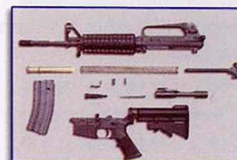
Field strips easily without special tools